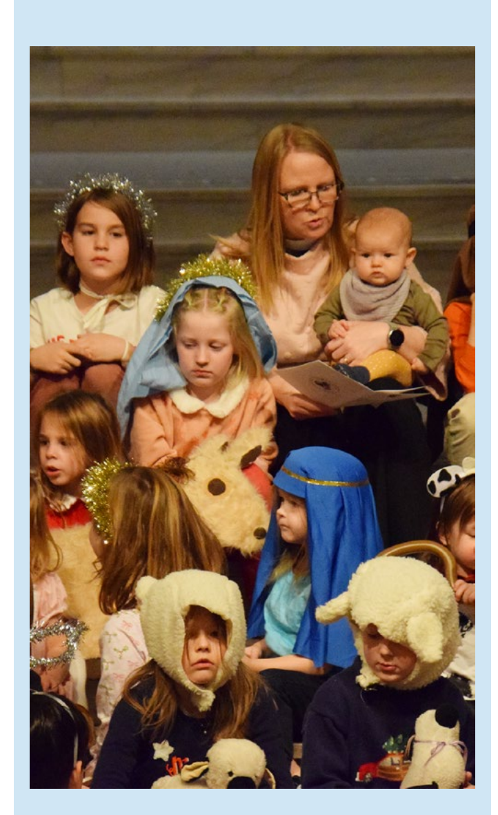
Koinonia with Christmas Pageant Wednesday, December 18, 2024 5:30 p.m. Community Dinner 6 p.m. Koinonia Eucharist with Pageant