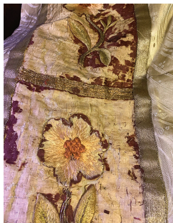
These two panels show their wear.