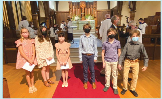
A new batch of acolytes ready for action