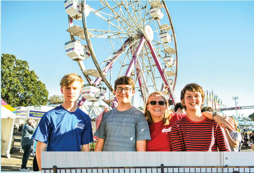
Central Convocation youth trip to the State Fair