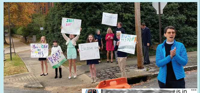
On the corner of 16th and Center cheering on marathon runners. This Facebook post came later that day.