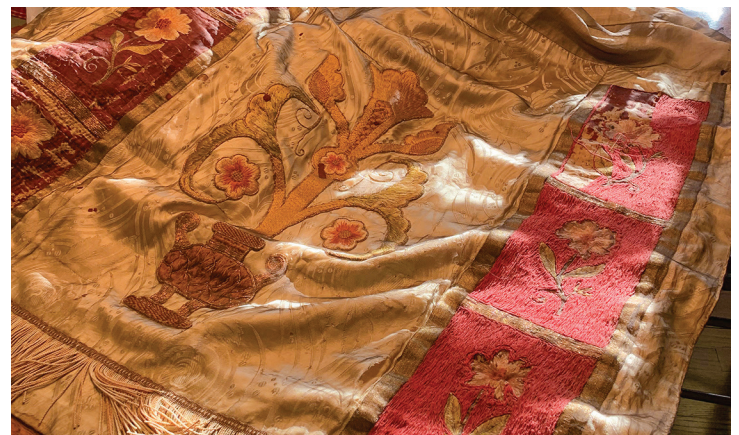
The red stitches on this panel are close to completion.