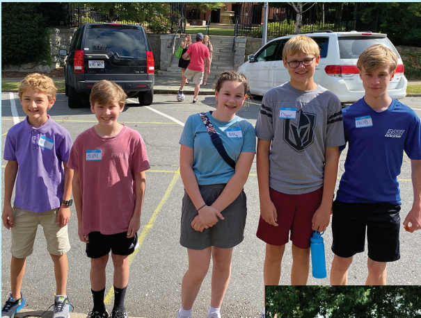
Trinity youth share an afternoon of soccer and other games with new Afghani friends.