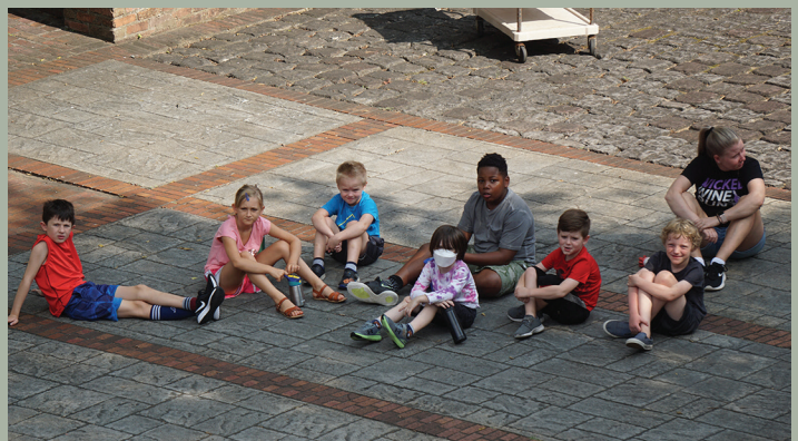
top: Sharing love with a furry friend; bottom: ECEP chapel time